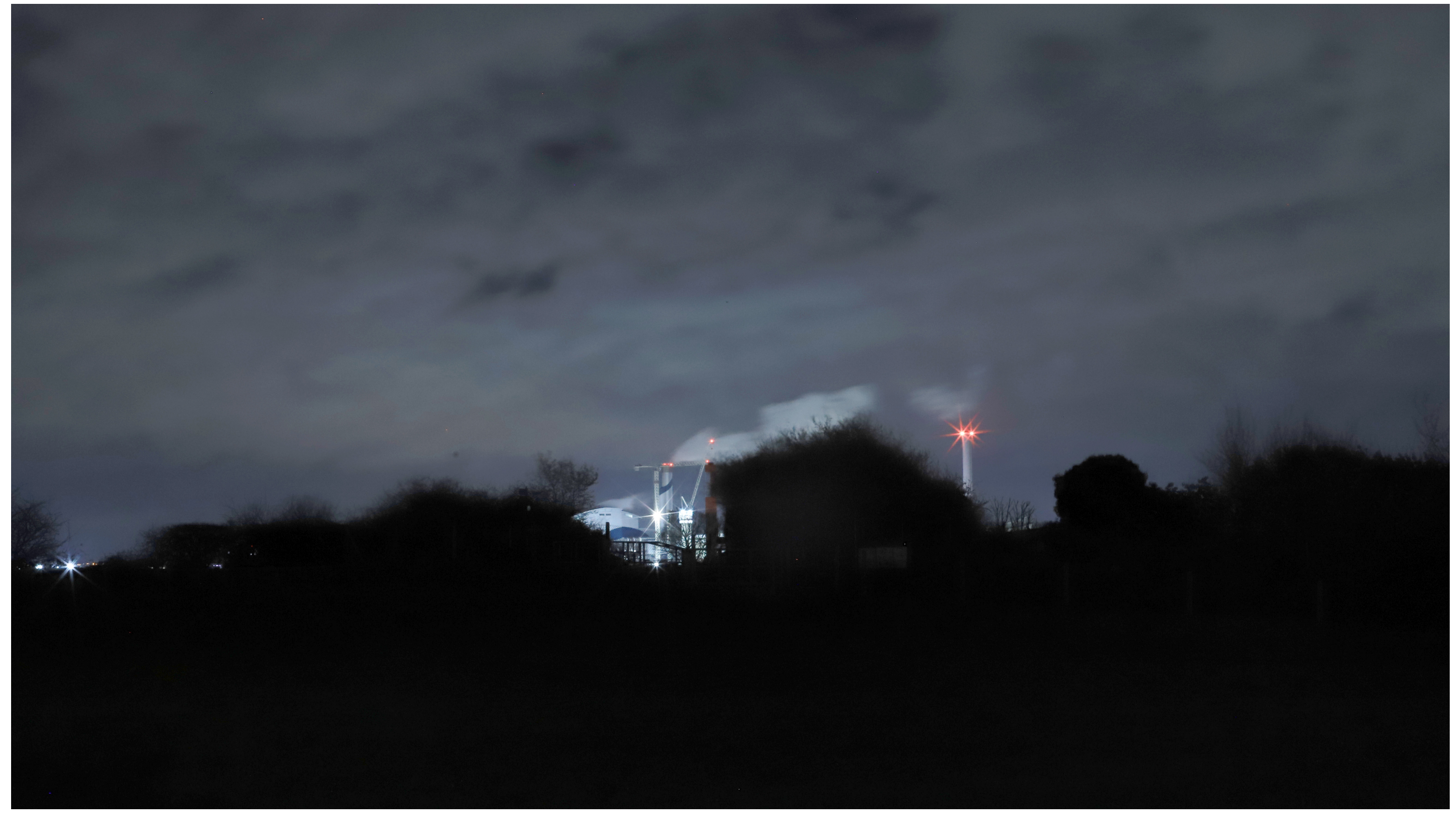
View 7: From Thamesmead Residential, Lytham Close, looking east