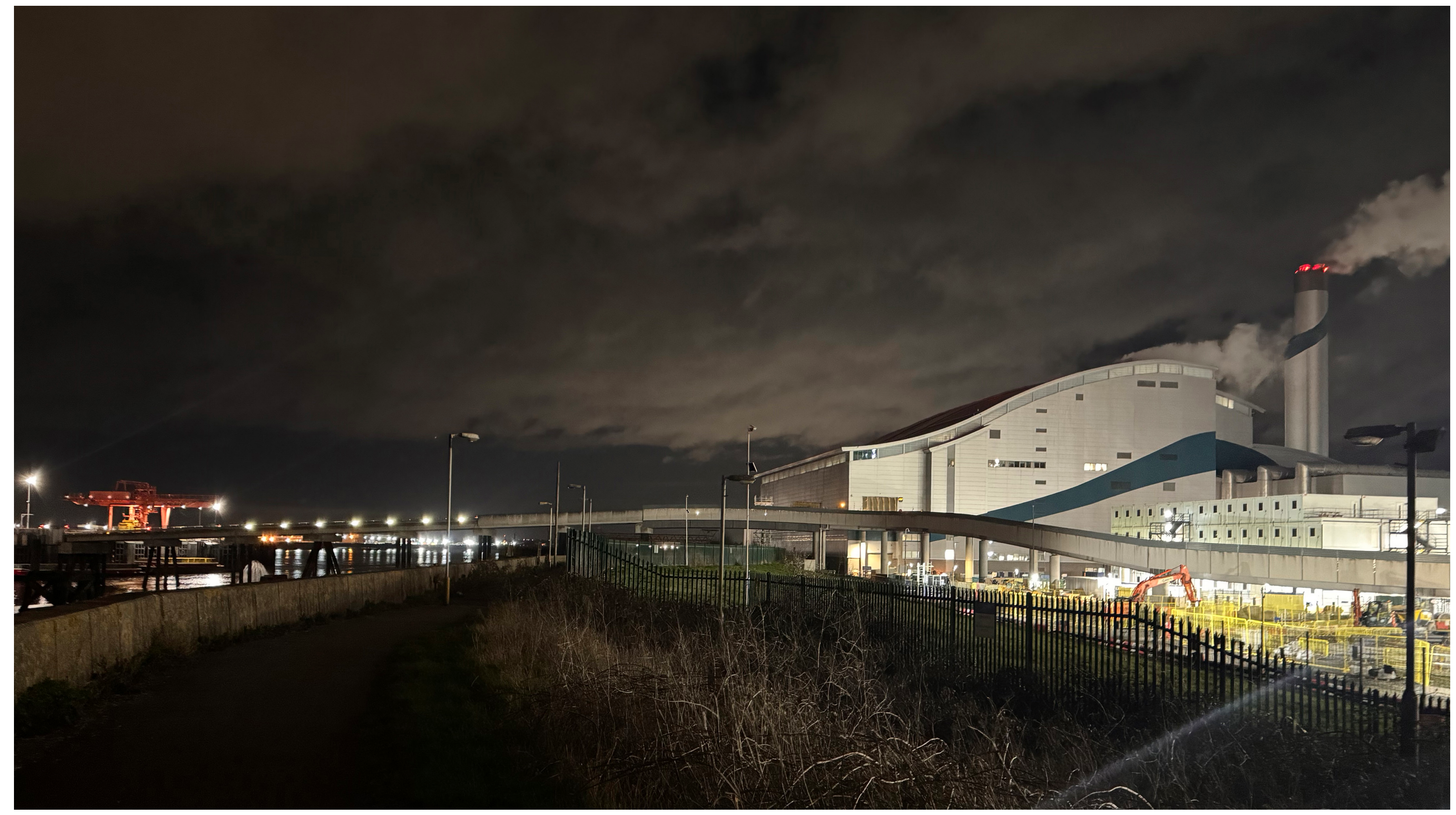
View 3: From England Coast Path, National Cycle Network Route 1, and Public Right of Way FP3 – looking east

Viewpoint Location: 51°30'22.73"N, 0°9'6.28"E