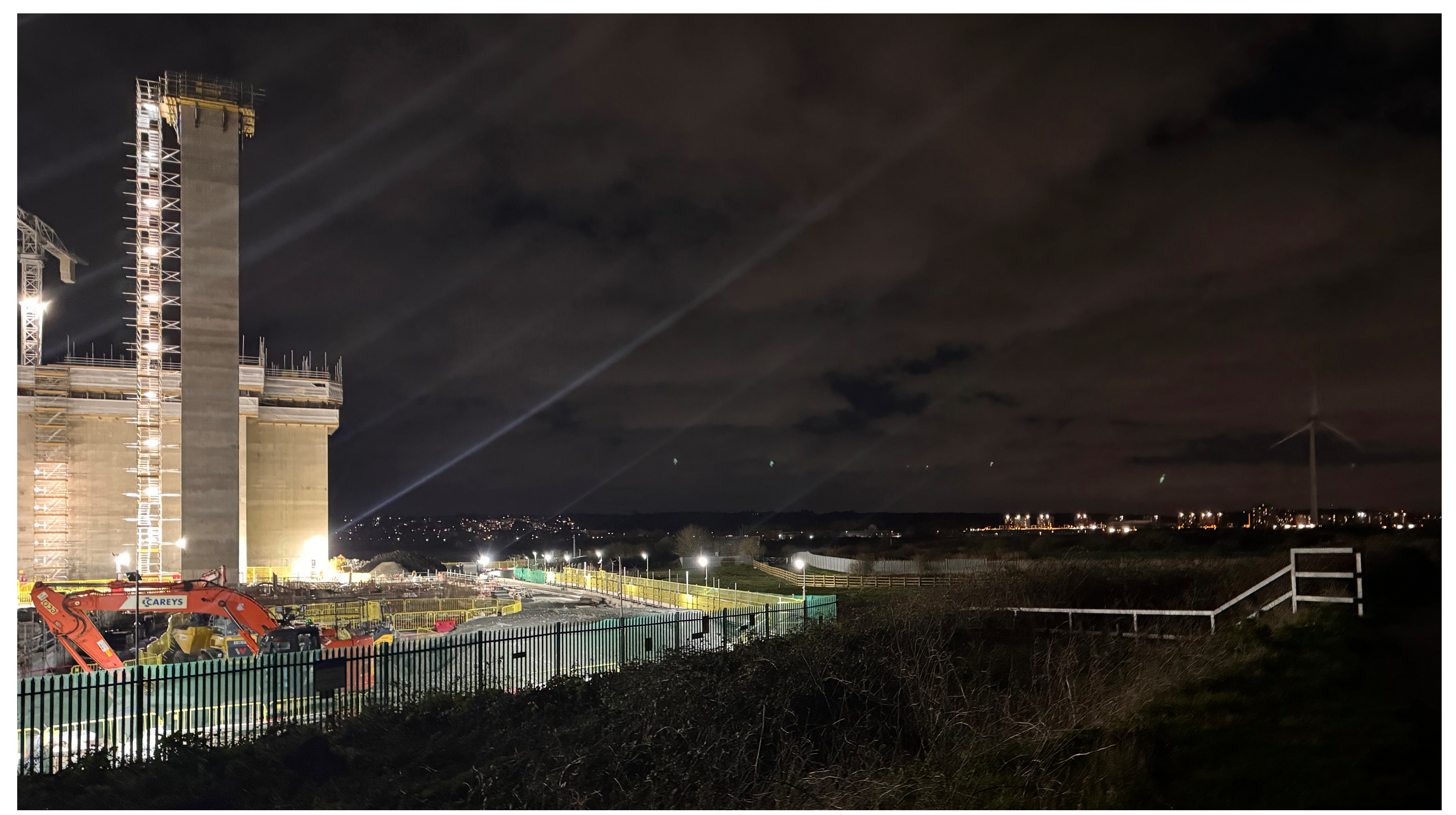
View 1: From England Coast Path, National Cycle Network Route 1, and Public Right of Way FP3 – looking south-west