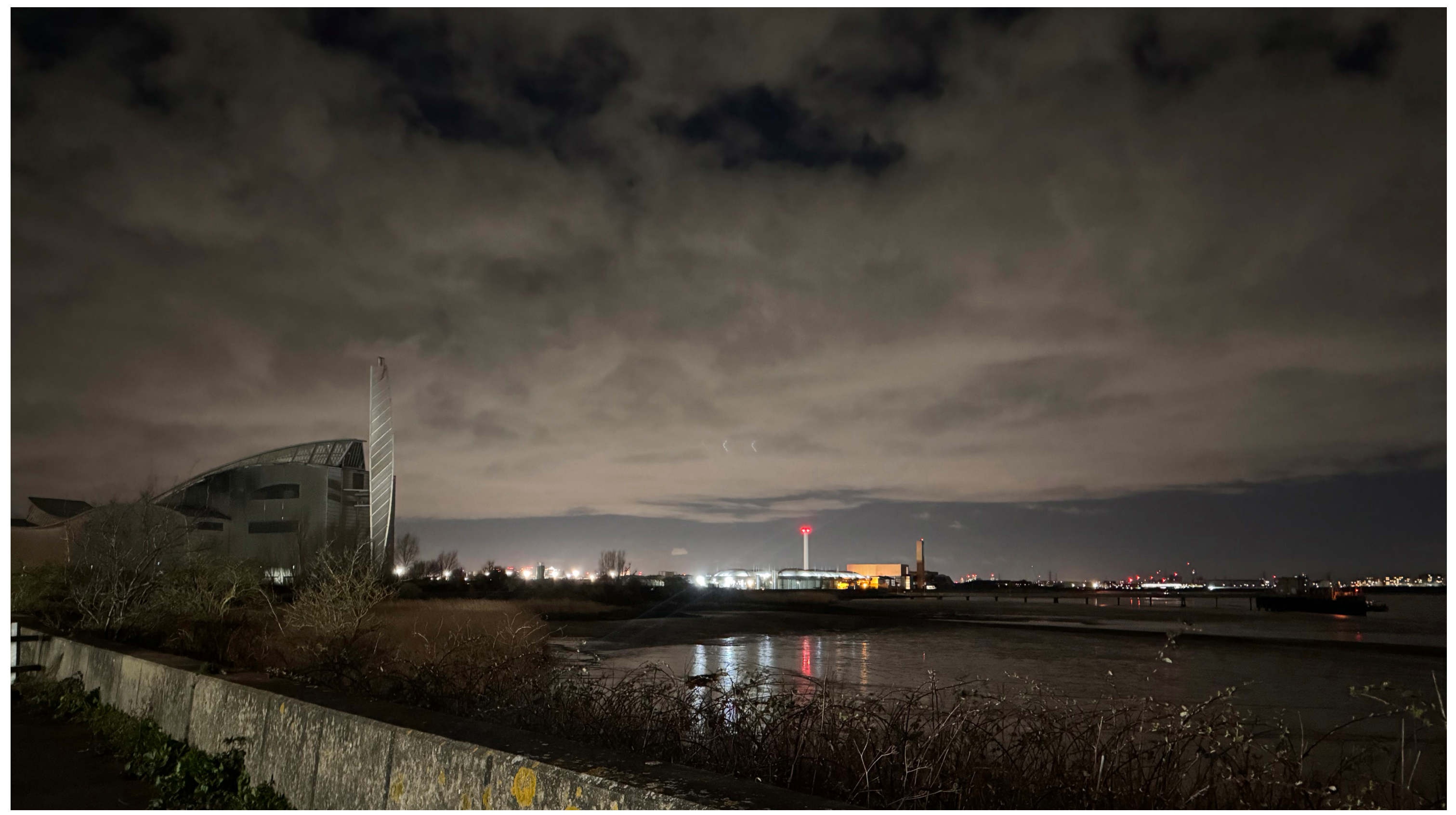
View 4: From England Coast Path, National Cycle Network Route 1, and Public Right of Way FP3 – looking west

Viewpoint Location: 51°30'22.70"N, 0°9'6.28"E