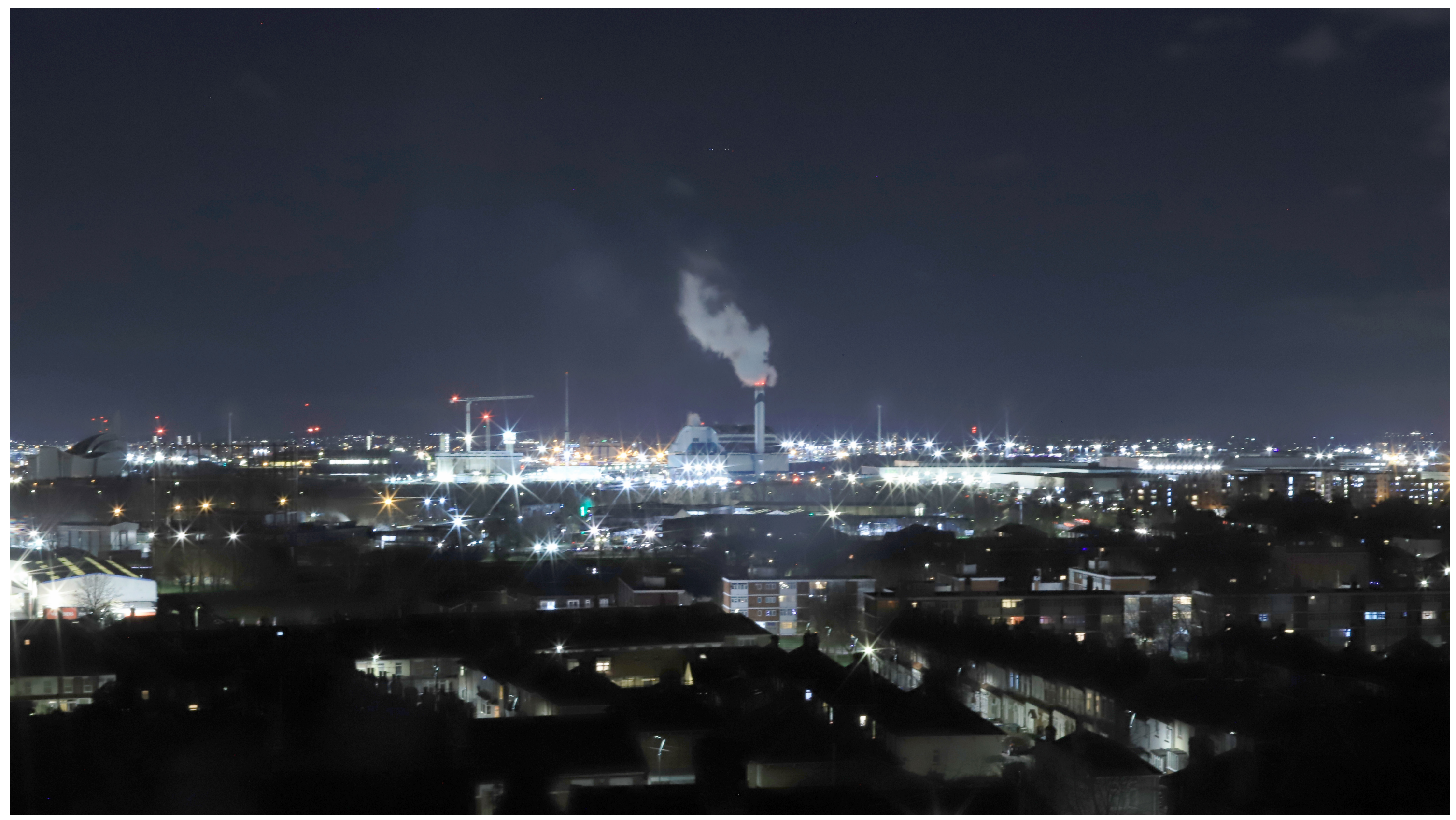
View 6: From Thames River Valley Panorama, looking north-east